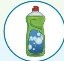
Liquid hand soap