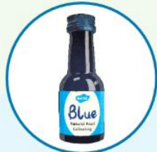
Food colouring (red, blue, green)